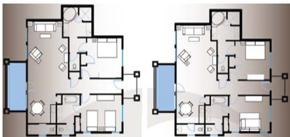
three bedroom suite