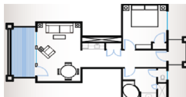
two bedroom suite